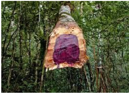
Recent Madagascar rosewood seizures (over 500 logs)